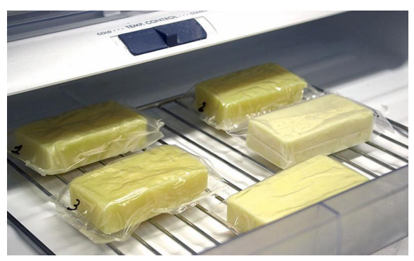
New casein film offers longer shelf life.

• Single-serve packaging, which is most preferred over others